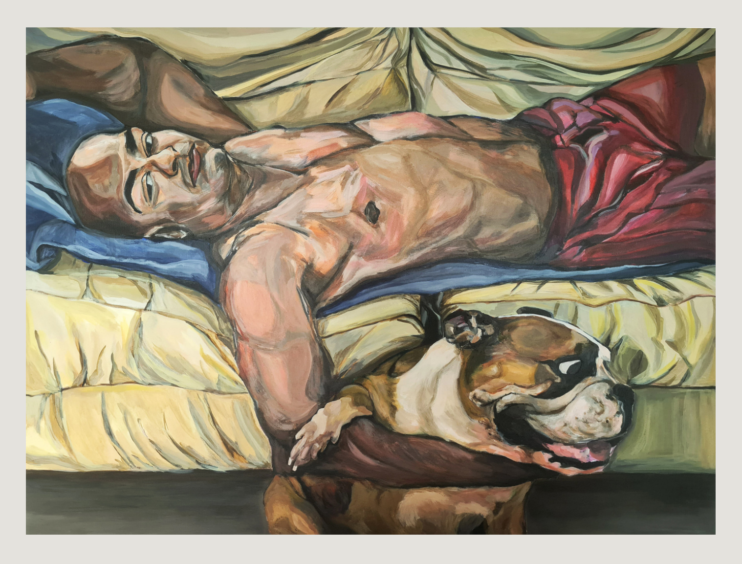
Man and dog , 2018, Acrylic on canvas, 30 x 40 inches, Not for sale

'Man and dog' was inspired by Modigliani's 'Red Nude' but it took on its own form when the artist decided to depict the relationship between the man and his dog in a contrasting manner.