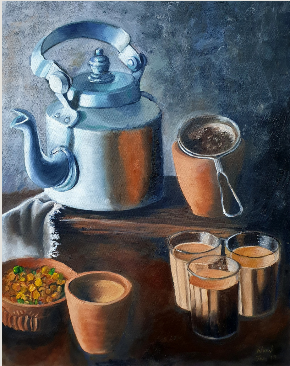
Cutting Chai , 2022, Oil on canvas, 16 x 20 inches, Not for sale

One cup of tea is never enough. The big kettle ensures that. The familiar aromas of ginger and cardamom bring back memories of pre-porcelain and china cup days.