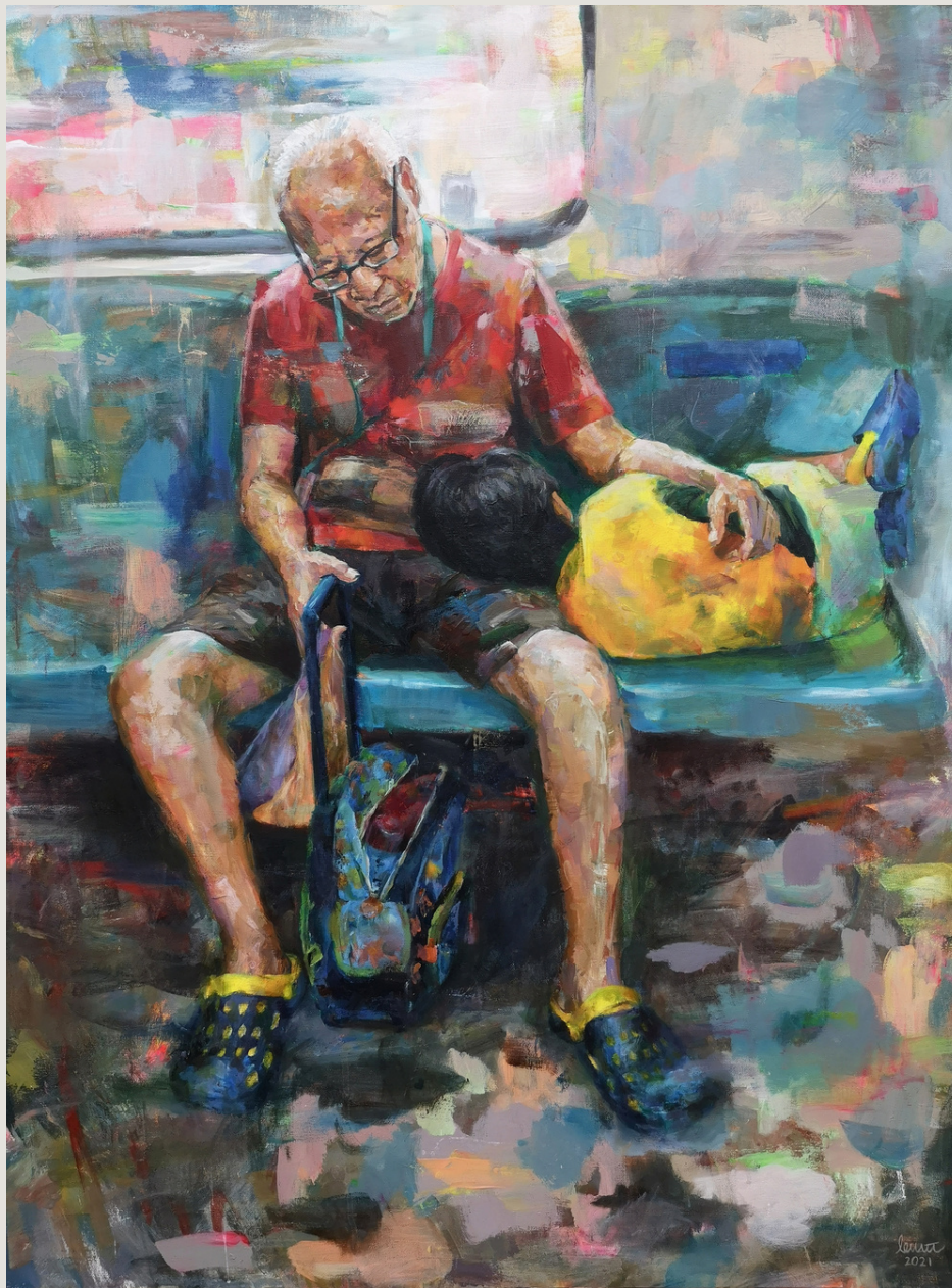
Train 7 - Blink Of An Eye , 2021, Acrylic on canvas, 30 x 40 inches, $3500

As the afternoon sun scorches outside, their eyelids grow heavy and close as grandfather and grandson catches forty winks in the train.